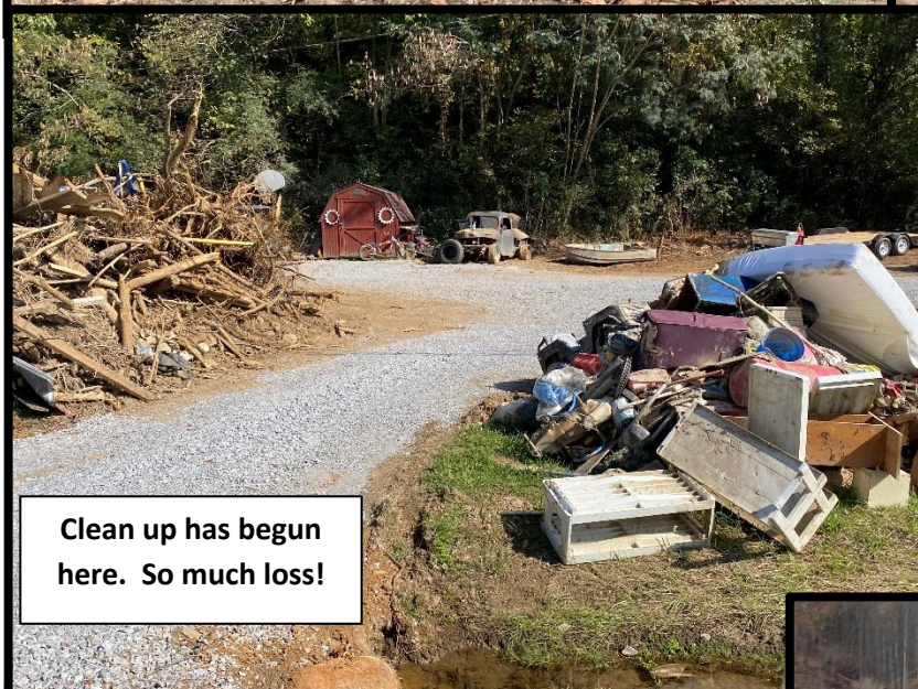
Clean up has begun here. So much loss!