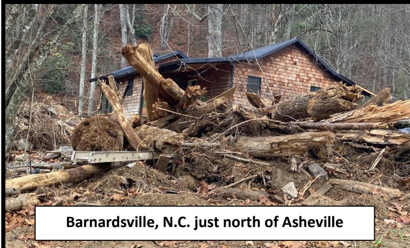
Barnardsville, N.C. just north of Asheville

We apologize for the time gap since our last newsletter. Last September Hurricane Helene came through – changing the lives of untold numbers of people forever. Since then, we have been very busy helping flood victims from Hurricane Helene during much of our time not previously committed to ministry. The pictures below are typical of the damage in many places in NE TN and Western NC.