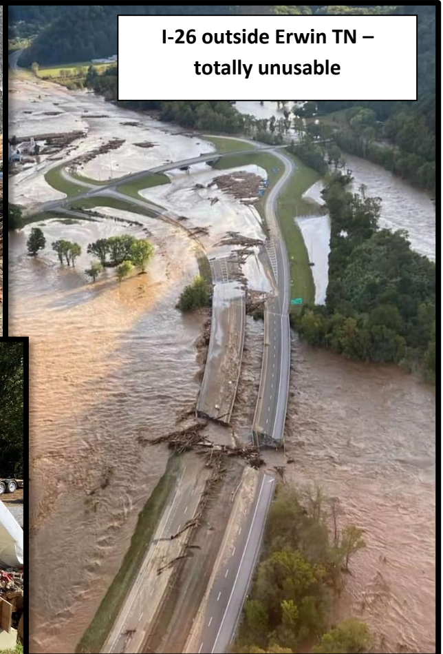
I-26 outside Erwin TN – totally unusable