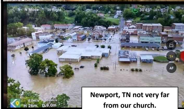
Newport, TN not very far from our church.