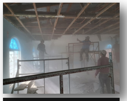
Demolition work to remove the old ceiling and roof

co-lead a team that worked at the Templo Monte Sinai Church in Nuevo Progreso, Mexico.