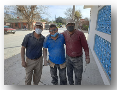
Three pastors from other churches helping with the demolition

This year, we were amazed that our God supplied 105 people to serve during the annual Net Menders mission trip. We stayed at a Christian renewal center in Arizona and crossed the border every day to various locations for work projects. I was asked to