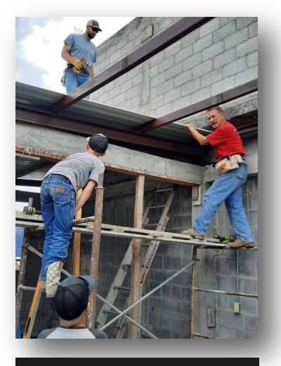
Smaller steel roof

That God has healed Perry's right knee after knee replacement last October