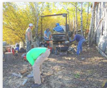
Mission team from Teton Valley Bible Church