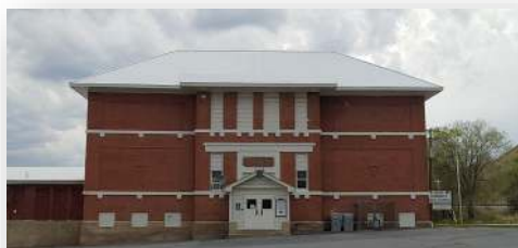
Finished church roof

If you are from the Southeast Idaho area, and you are traveling past Inkom on Highway 15, when you see that white roof right next to the highway, please remember to say a prayer for them.