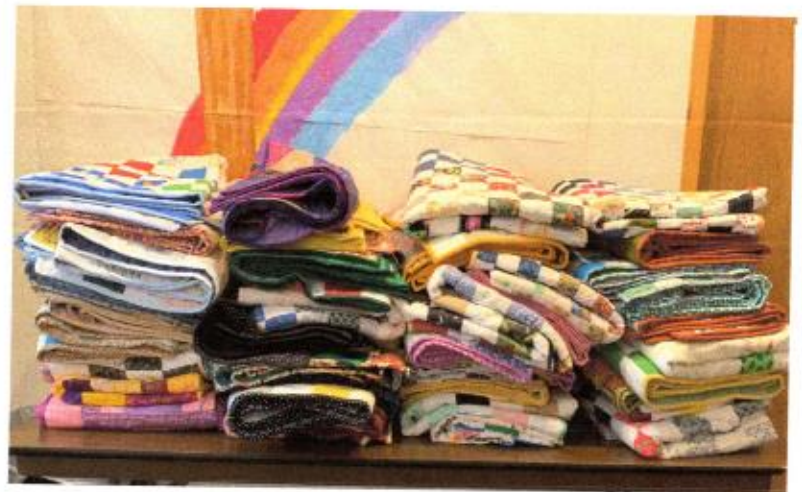
Some 115 quilts that women of the church made for local homeless school children, for an orphanage in Mexico, and other projects. And they're making more quilts, preparing for whatever comes next. Who knows how God is making use of the work these women do?

Surely God uses the prayer chain as another tool to bring the people of the church together during this physical separation.