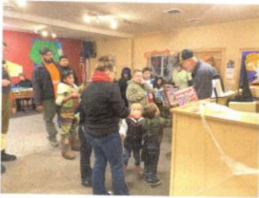
Neighborhood Harvest Party