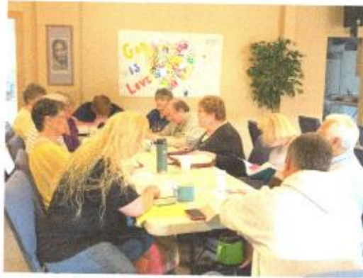
Adult Sunday School Class with strong attendance