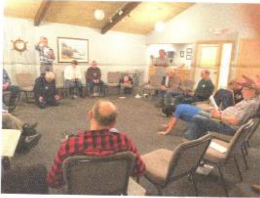
In Tillamook there is an annual three-day prayer meeting of pastors from the three coastal counties northwest Oregon